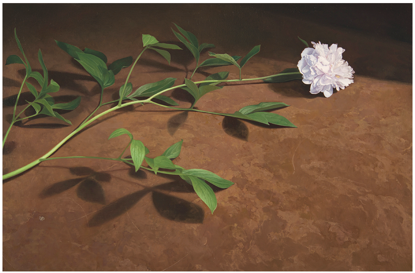
Touch, oil on canvas, 26" x 40"

collaboration between myself and that flower. Artists have used flowers as subject matter in still life paintings for hundreds of years, and yet it would be a terrible mistake to believe that their potential to be used as a means for delving into the nature of human experience has been exhausted. I use the flower as a vehicle, loaded with all the implications a living organism embodies. It provides me with a means for channeling something internal, fragile, and elusive that no other subject could accomplish."