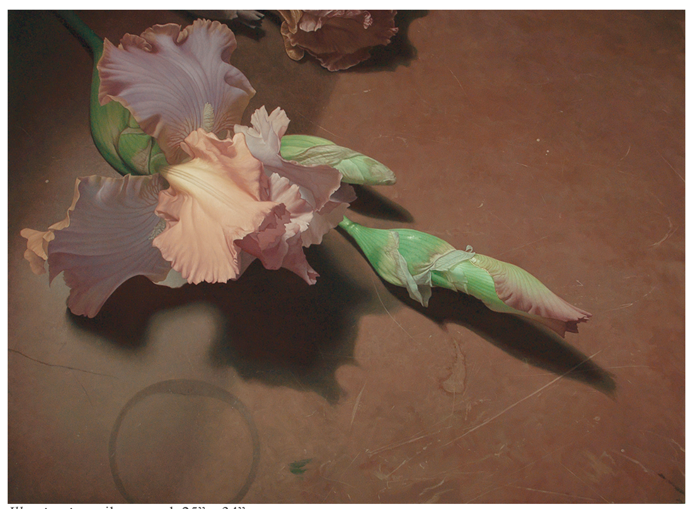
Illumination, oil on panel, 25" x 34"

Depew's work bridges the gap between traditional realism and contemporary style, with pieces ranging from miniatures, like Gem at 7 x 8.5 inches, to expansive forestscapes like Pulse , which measures 44 x 64 inches. Haynes Galleries is currently featuring seventeen pieces, with a variety of sizes and natural subjects.