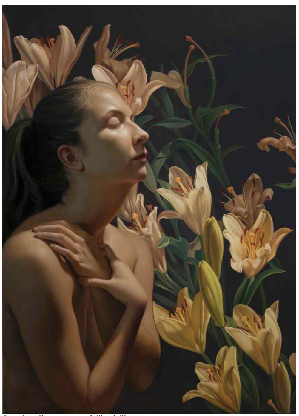
Insight, oil on canvas, 36" x 26"